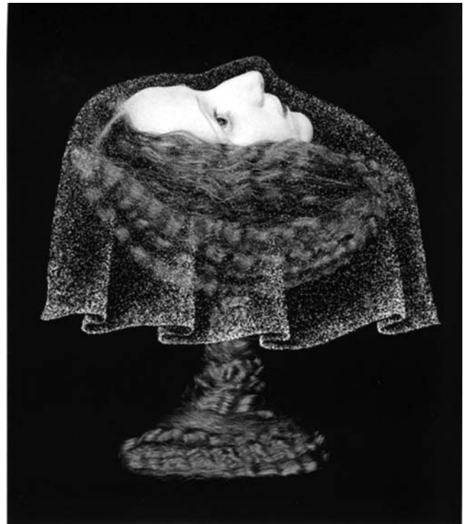
Figure 3. Rimma Gerlovina and Valeriy Gerlovin, Grail , © 2002 www.gerlovina.com

This image reminds me of a personal sacrifice which could be seen in a situation where a person feels she must give up the personal life to support someone or something else. I actually feel that way about serving as a caregiver for my husband sometimes although