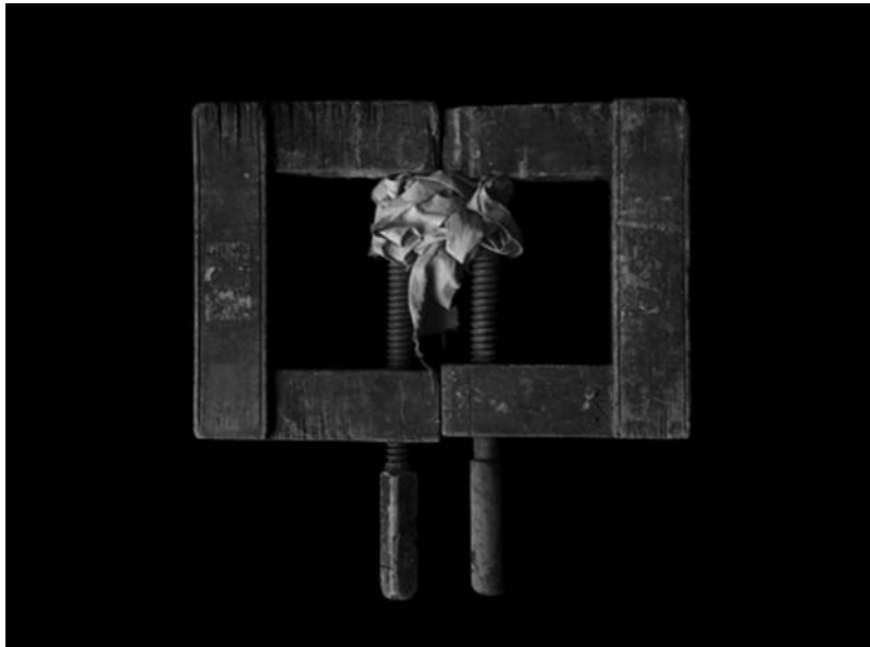
Figure 5. Stephen Althouse, Clamps . Collection of the Musée d'Art moderne et d'Art contemporain, Liège, Belgium (Courtesy of the Artist)

and even spiritual imagery are all evoked by the “simple” photograph of a dog posed inside a tire.