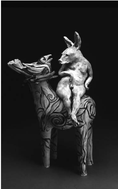
Figure 7. Juliellen Byrne, Horse, Bird, and Rabbit , 2005. The Burkhart Collection (Courtesy of the Artist)