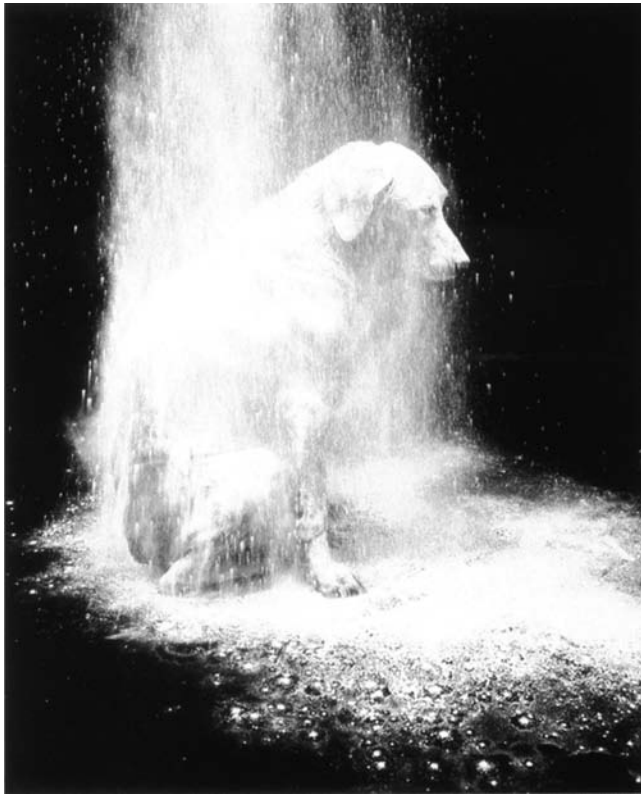
Figure 2. William Wegman, Dusted , 1990

Issues as charged as death, loss, and infertility were discussed.