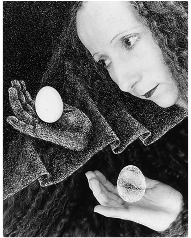
Figure 1. Rimma Gerlovina and Valeriy Gerlovin, Two Eggs , © 2002 www.gerlovin.com

After the images have been discussed, the participants are asked to voluntarily write a paragraph or two, addressing how the image relates to their lives. The writing period lasts as long as pencils are moving, usually about 7 to 10 minutes. The facilitators then ask people to voluntarily read aloud what they have written. The quotations that follow are from these exercises. The writing evokes smiles, tears, nods of agreement, and sometimes laughter. The facilitators always acknowledge contributions from the participants but remain neutral to encourage others to engage. Oftentimes the writings prompt more discussion. At the end of each session, participants may voluntarily submit their writings to the facilitators with the knowledge and consent that what they have written may be quoted for later use (anonymously or signed by choice).