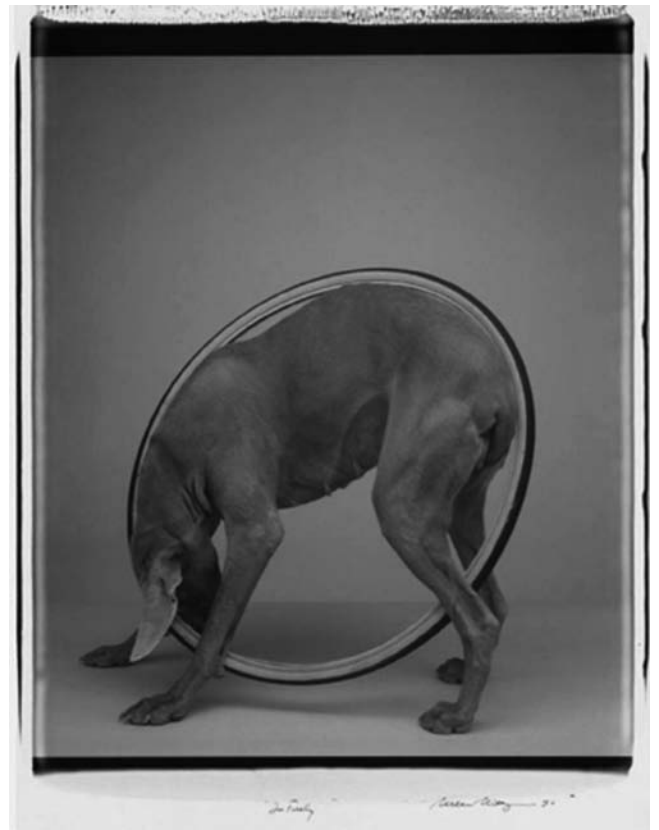
Figure 4. William Wegman, Intirely , 1990 (Courtesy of the Artist)

I see the circle as the universe surrounding me (the dog), that I am not alone with having cancer. There are others out there that have cancer just like me. I am not alone, there are others with cancer to lean on